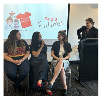
(Above) Speakers and guests at the Bright Futures NT workshop.