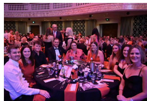
Total Property Group