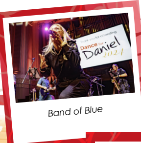
Band of Blue