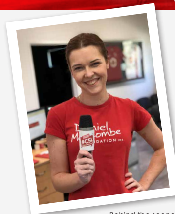
Behind the scenes

The educational video, produced annually by the Foundation, aims to deliver personal safety messages to children across the country in a fun and engaging manner. ABCSL sits within National Child Protection Week (September 1 – 7), a time where the nation focuses on efforts to keep children safe.