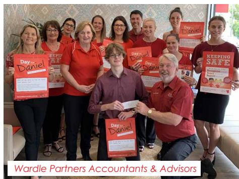
Wardle Partners Accountants & Advisors