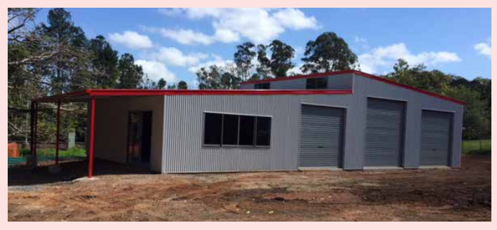
The shed is almost finished

Due to open in mid-February, construction works have progressed at a cracking pace. Murphy Builders along with another 60 industry suppliers, including Hi-Tec Concrete, Crown Power Air Conditioning, BRD Group, Dynamic Bradview Roofing, Australian Garage Supermarket and Hyne Timber to name a few, have stood tall and given generously. The build has bought together some amazing contributors from the construction and building world on the Coast.