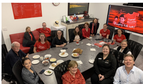
Launch day morning tea with cast, crew and ACCCE