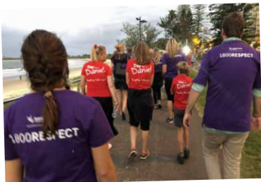
Walk against Domestic and Family Violence on the Sunshine Coast