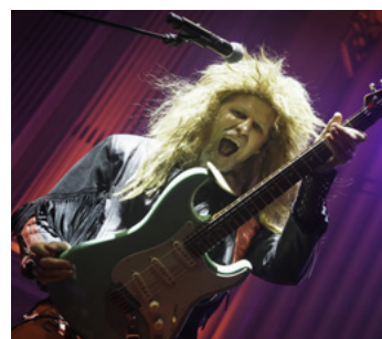
Electric 80s Band