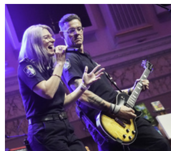
Band of Blue